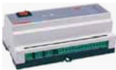
PM100Y001 240 volt control unit with 8 - R/T inputs.