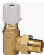
ART.554 3/4 3/4" Pressure Differential By - Pass