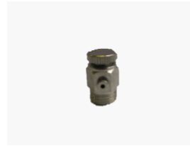
ART.342 1/8N 1/8" Manual Air Vent (Nickel) ART.342 1/4N 1/4" Manual Air Vent