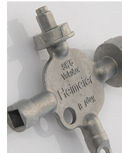
0530.01.433 Heimeier Universal Key