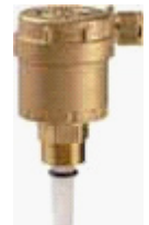
R88IY002 3/8" Automatic Air Vent With interrupter R88IY003 1/2" Automatic Air Vent With interrupter