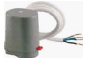
R473MX001 normally closed 240 volt actuator for thermostatic option valves with build in micro switch