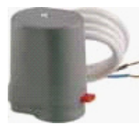
R473X101 normally closed 240 volt actuator for thermostatic option valves