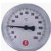
R540Y002 1/2" Temperature gauge 0 to 120 degree c