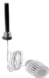
T100R-AB Honeywell 30°C Temperature Controller