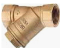
R74AY003 Y-filter 1/2" R74AY004 Y-filter 3/4"