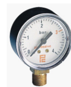
ART. 562 1/4-4 1/2" Gauge