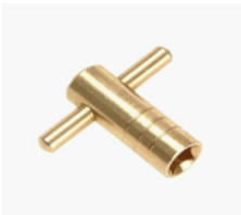
003 KEY Air Bleeder Key (Brass)