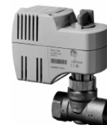
MVI421.15 Siemens 15mm Two Way Zone Valves (240 volt) MVI421.20 mm MVI421.25 mm