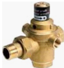
R150BY103 1/2" Auto filling Valve with 1/2" nut and tail connection