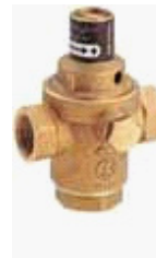
R150Y103 1/2" x 1/2" Auto filling Valve