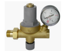
ART.513 Pintossi - 1/2" Automatic Fill Valve c/w Gauge