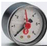
R225Y001 Pressure gauge