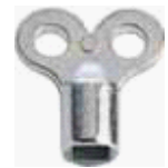
R74Y001 Radiator vent key