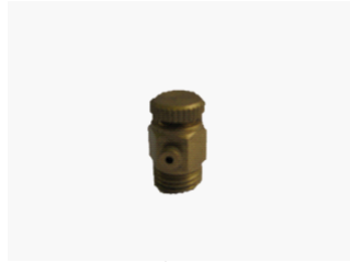
ART.342 1/8B 1/8" Manual Air Vent- Brass ART.342 1/4B 1/4" Manual Air Vent