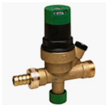
VF06-1/2B Honeywell - 1/2" Auto- matic Fill Valve