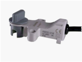
ASC2. 1 1/8 Auxiliary to suit MVI