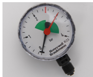
MF 126 Honeywell - 0-4 Bar Pressure gauge