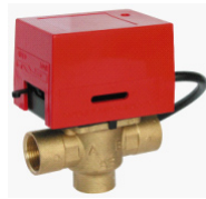
ART.703 1/2 1/2" Three Way Zone Valves (240 volt) ART.703 1"