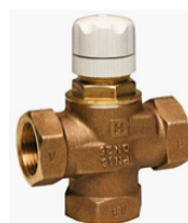
V135-11/4B Honeywell 32mm Three Way Valve Body