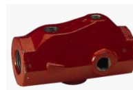
ART. 531 1 1" Inline Air Separator ART. 531 1 1/4" ART. 531 1 1/2" ART. 531 2"