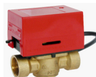
ART.702 1/2 1/2" Two Way Zone Valve (240 volt) ART.702 3/4" ART.702 1"