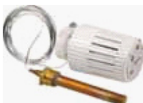
R462LX021 Temperature controller for slab